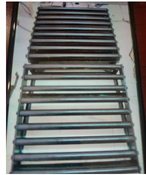
RAMP ROLLER PLATFORM