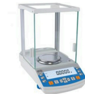
TABLE TOP SCALE

Mini table top scale Pan size - 250 x 200 mm